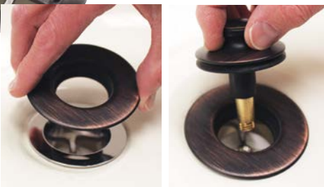
...drop in designer finish and stopper when construction is finished.