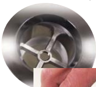
Rough-in with chrome...