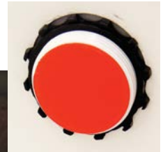
Overflow test membrane